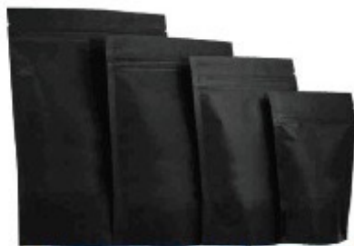
Black Paper / Black Paper