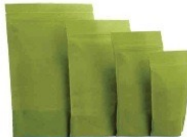
Green Paper / Green Paper