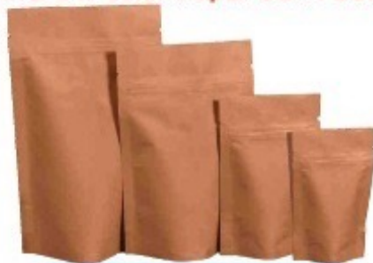
Brown Paper / Brown Paper